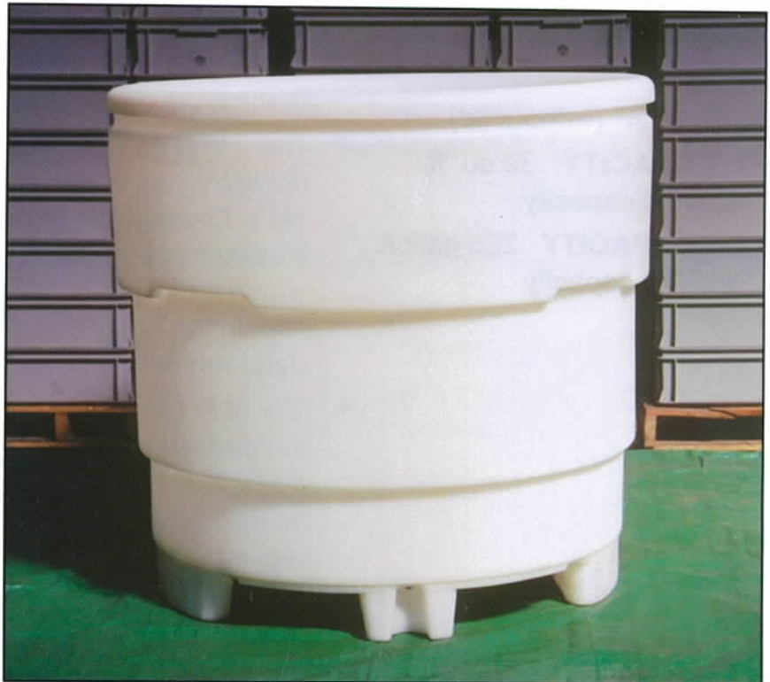
Round Flat Bottom Bin RFB-44